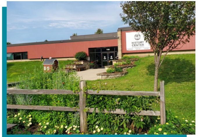
Thinking Spring at HCOC