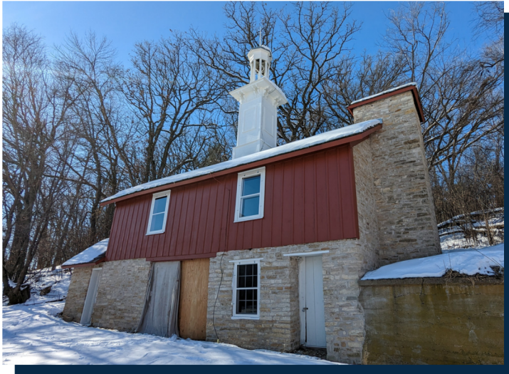
A recent photo of progress this winter versus the early start in Sept/Oct.