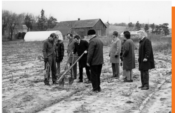
Groundbreaking near the current HCOC location in 1972.

"As a fifty year old hub, the building has done an admirable job"