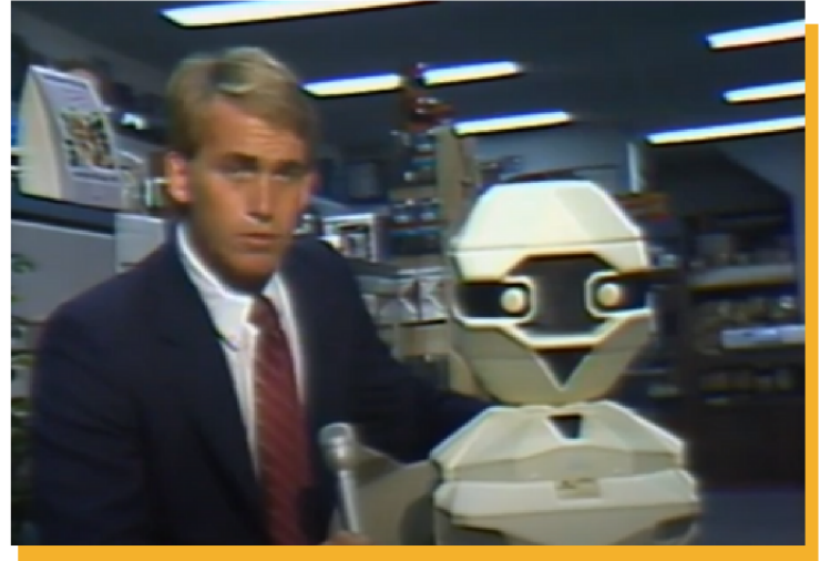
Our YouTube videos provide a fun look at the recent past!

If you're not currently a subscriber to our YouTube channel, now is a great time to sign up and enjoy!