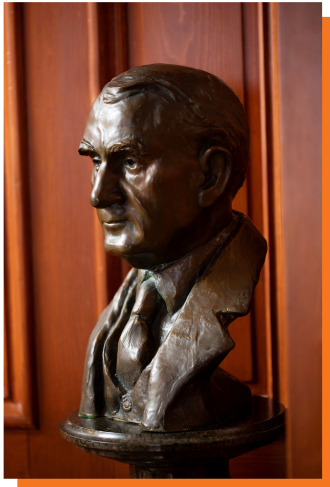
The bust of Dr. Charlie

Mayowood season is coming soon! Be sure to check olmstedhistory.com/mayowood for more info on our tour times and coming events!